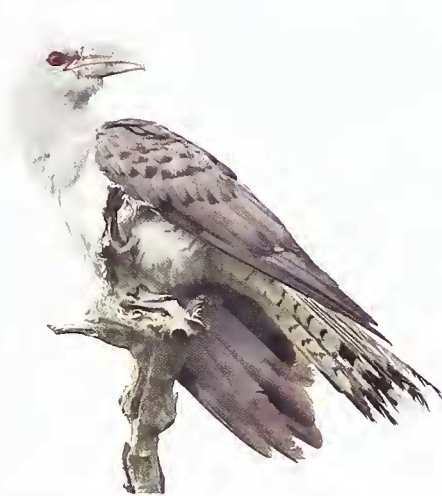
Plate 11. Channel-billed Cuckoo Scythrops novaehollandiae , Aborlan, Palawan, 19 February 2011.